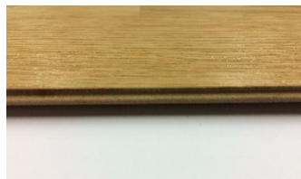
Linnea Fineer parket (16-11-0063)